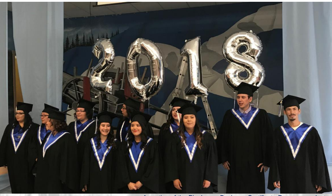
A section of the Pinehouse Business Certificate Program graduates

The program will benefit both the community and individual graduates who may take up jobs in the area, or pursue further education. Many others may also be motivated to earn their high school diplomas or post-secondary credentials. Congratulations to all the Pinehouse Business Certificate Program graduates.